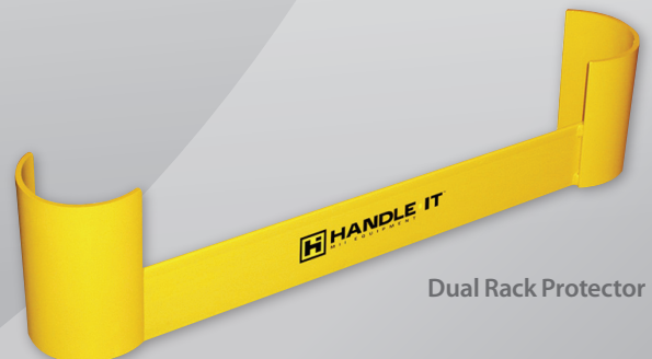
Dual Rack Protector