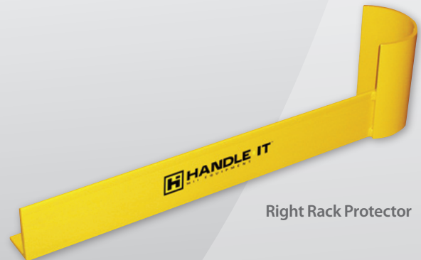
Right Rack Protector