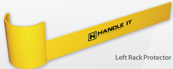
Left Rack Protector