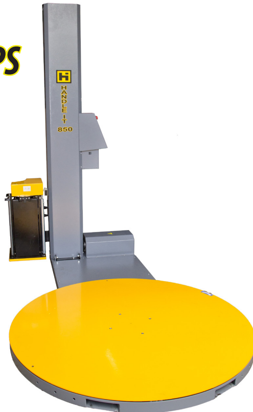
Part Number: SWM-SA-0850PS