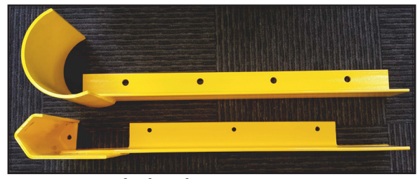
Standard Rack Protector vs. Space Saving profile