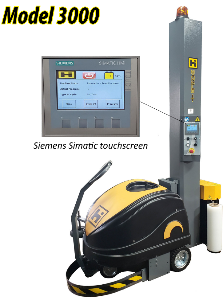
Part Number: SWM-MR-3000