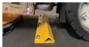
Forklift Wheel Stop