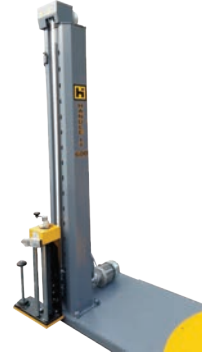
Powered carriage tower with photo eye