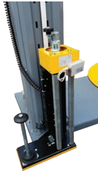
Easy film threading with mechanical film tension