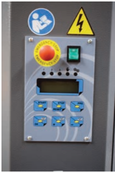
Easy to use control panel