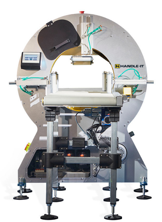
FA-50 with driven conveyors (optional) Top & lateral presses (optional)